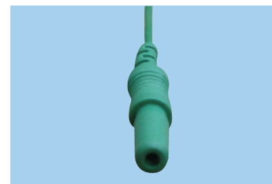
M = 1.5 mm connector

71410-M/1 ● Product ● Connector ● Wire length ● Electrodes in pouch